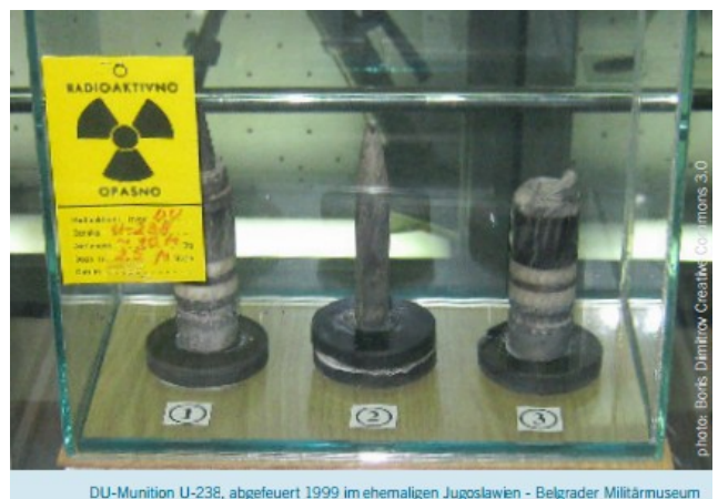
DU-Munition U-238, abgefeuert 1999 im ehemaligen Jugoslawien - Belgrader Militärmuseum

The last point illustrates a tendency: More and more states view the use of DU weapons critically.