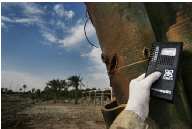
Einschusslöcher durch DU-Munition in einem irakischen Panzer weisen hohe Rückstände an Radioaktivität aus • Aus der Ausstellung: The Human Cost of Uranium Weapons - Irak